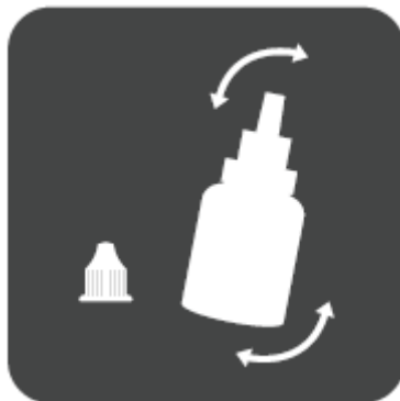
Step 2 – Remove cap and shake the bottle.