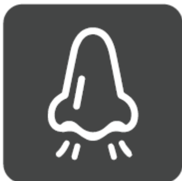
Step 1 – Blow your nose.