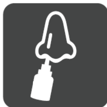
Step 4 – Place the nozzle of the bottle just inside the nose and apply 1 to 2 sprays into each nostril. Inhale gently while squeezing but do not inhale deeply.