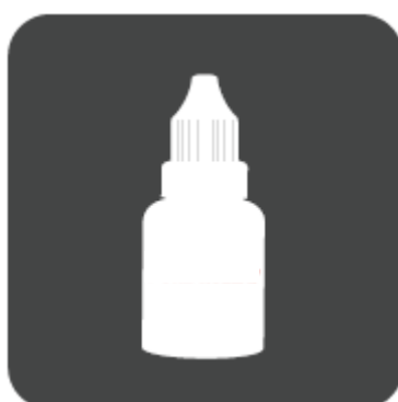
Step 5 – Re-apply each time you blow your nose.

If concurrent use of another nasal spray is required, Nexa TravelShield should be re-applied afterwards so that the barrier created is not disturbed.